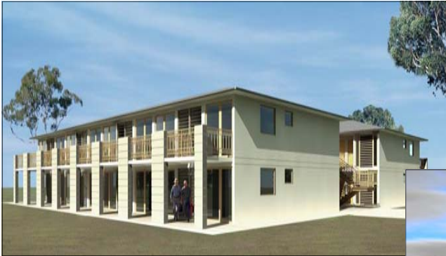
Infinite Design Possibilities up to 9 stories high