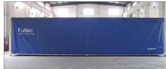
Protected and packed for international shipping