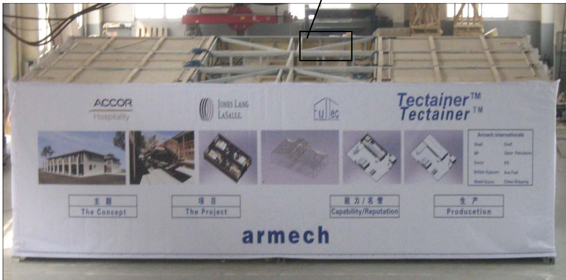
Above 3 modules create 4 hotel rooms