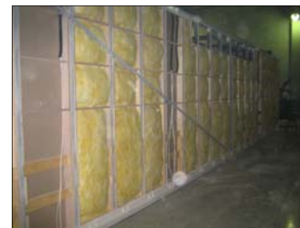
Pre-finished with high insulation values. Twice the UK standard. Keep warmth and heat out!

Save millions on site by building your Hotels on a production line.