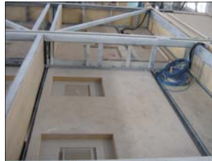
Pre-wired & pre-plumbed