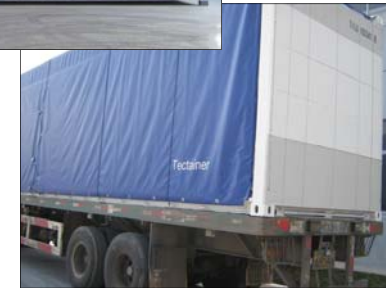
On Chassis ready to ship